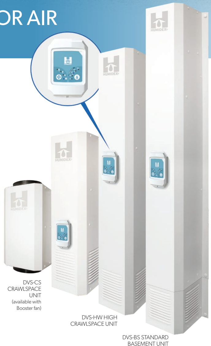
DVS-CS CRAWLSPACE UNIT (available with Booster fan)