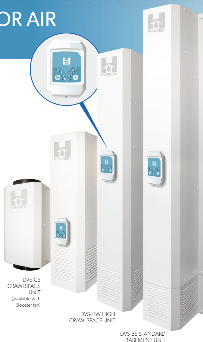
DVS-CS CRAWLSPACE UNIT (available with Booster fan)